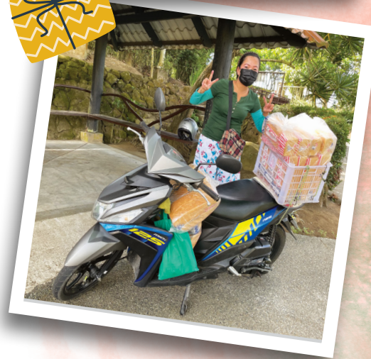
(From top to bottom) Beneficiaries who received their school supplies from Pag-asa. Some of the many Donors of our Community Pantries.