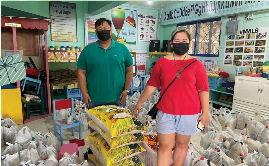
Some of the many Donors of our Community Pantries.