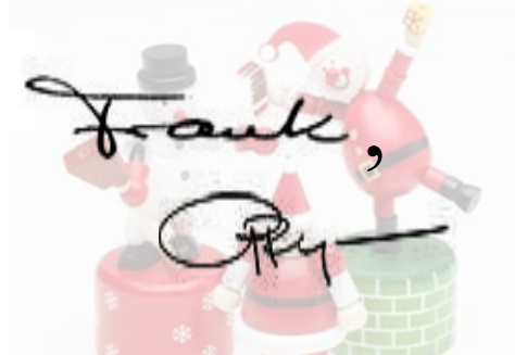
and the staff of Pag-asa Social Center Foundation Inc.

May you have the real happiness of Christmas which is hope; the spirit of Christmas which is peace: and the heart of Christmas which is love.