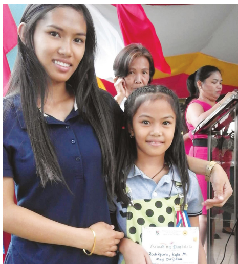
Some of the achiever beneficiaries

A motivating environment like Pag-asa promotes respect for student diversity and