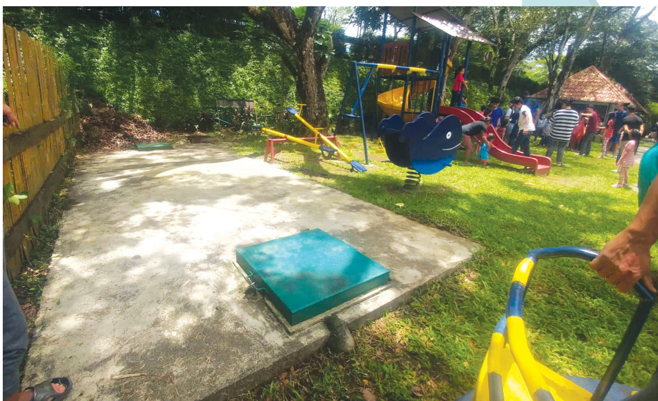
First phase of our Water Project