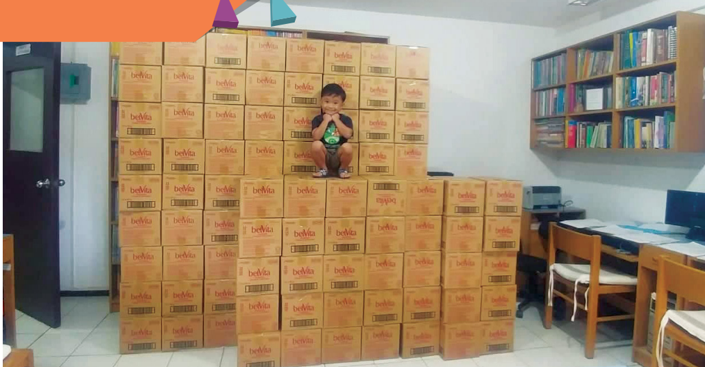
Boxes of biscuits donation from Biscuits, Intern

Here in our local situation nowadays, it is indeed comforting to hear someone asks you this question from time to time specially during our troubled times. The current economic situation of the Philippines is going from bad to worse, like most other countries worldwide, more so in our Country. This affects of course everyone else including Pag-asa.